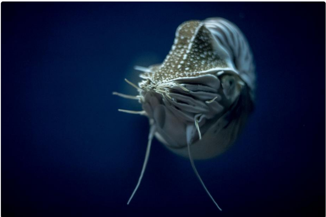
"Nautilus Octopus"

Return to Login Page . You'll be logged out from the Identity Provider when you retry logging in.