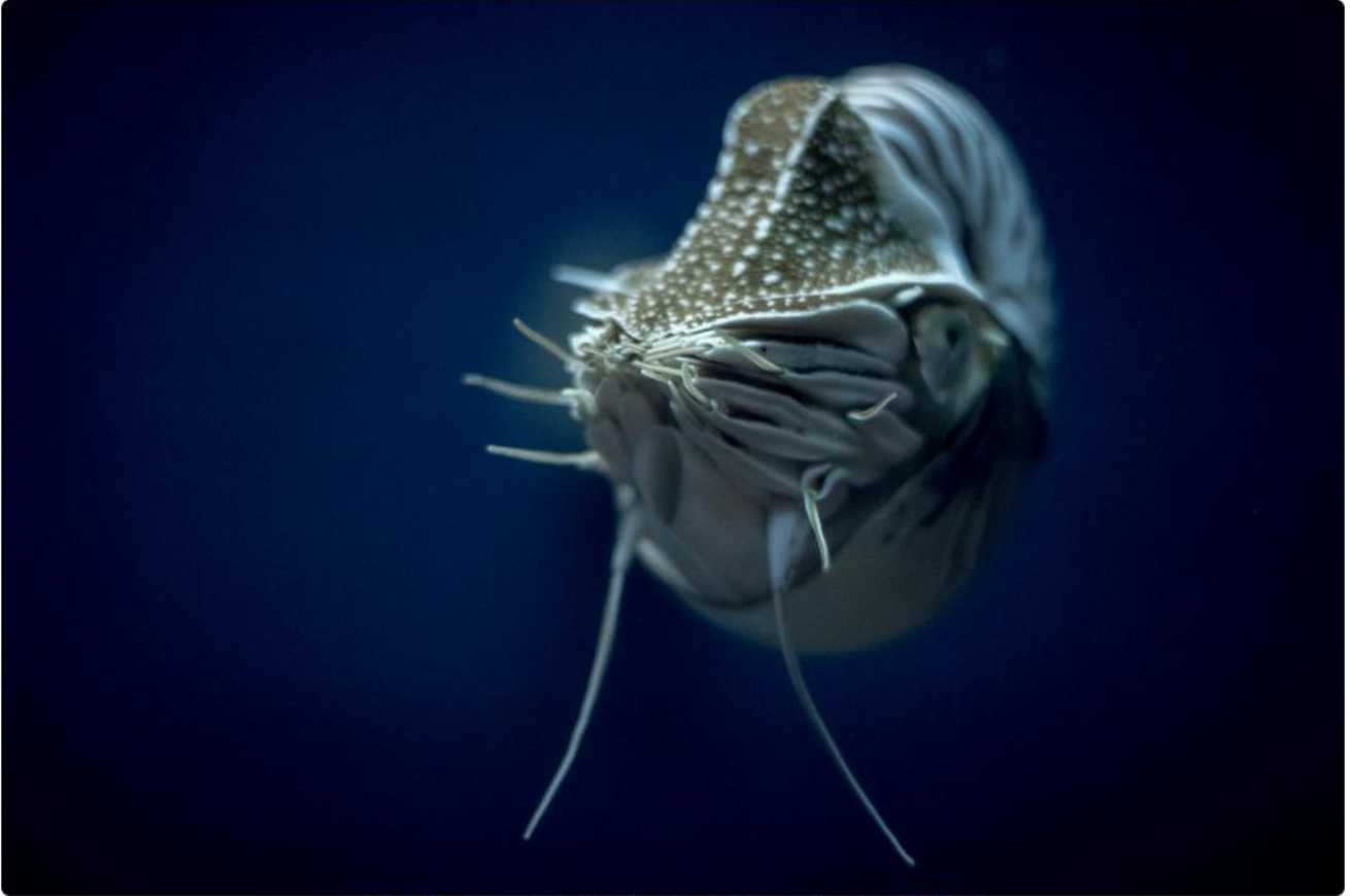
"Nautilus Octopus" by Jin Kemoole is licensed under CC BY 2.0